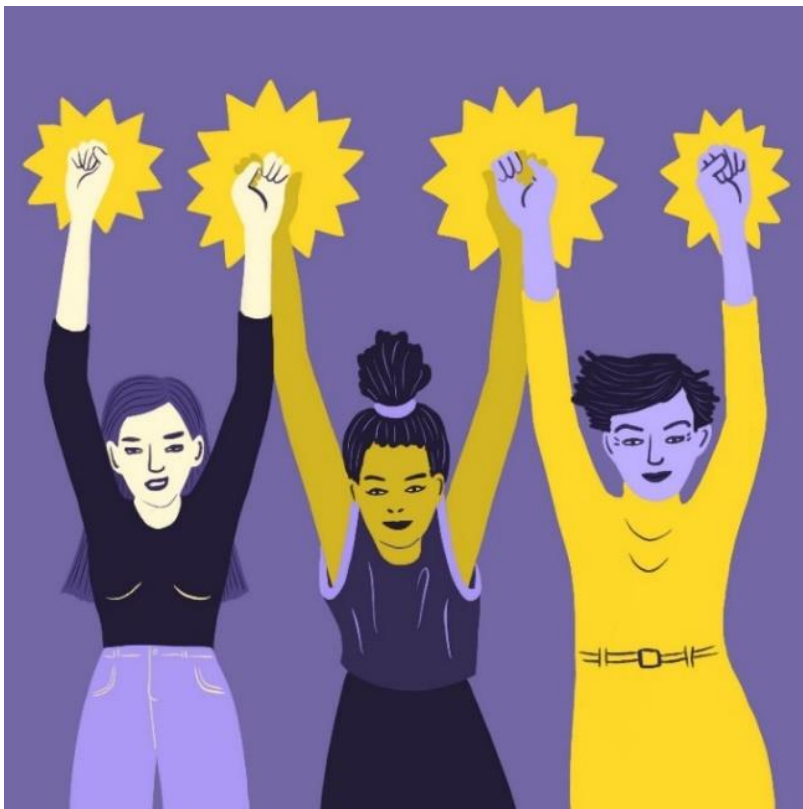
Illustration: Doro Spiro